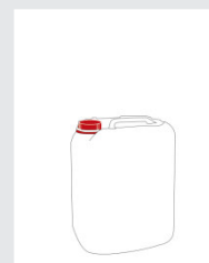
Can 5 l Art.-No.: 2005148