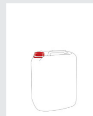
Can 10 l Art.-No.: 2000028