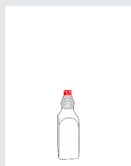
Bottle 8x 230 ml Art.-No.: 2000788